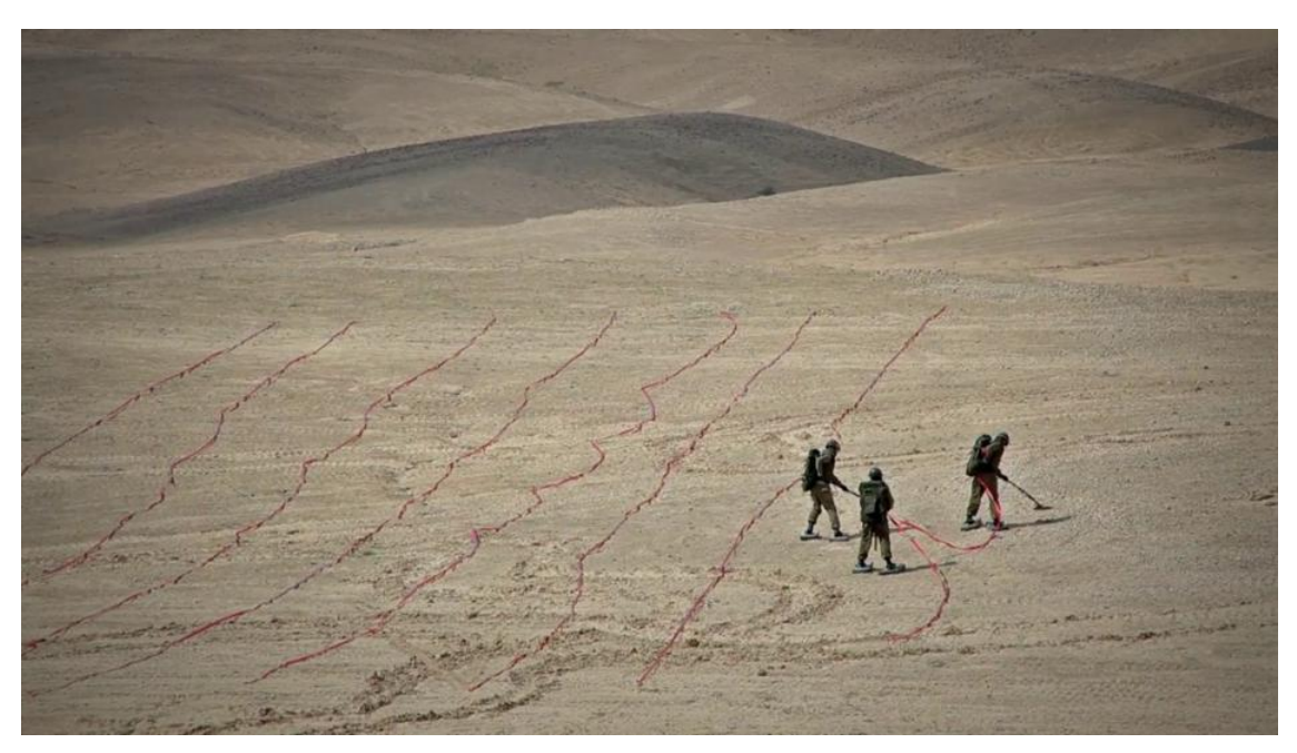
Seeds (2012), HD Video, 5min 3sec

The work "Seeds" explores the phenomenon of the buried mines that exist in Israel and the world over, exposing how these areas still carry the consequence of the war within their soil while supporting the new populations who must inhabit the conflict area. It examines the power of the present moment in these places where efforts are beginning to shift these death zones into places that consciously affirm life, embracing continuity in the very place where it once was blocked.