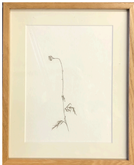
Soil (2019), Aquarelle, soil on paper, 32 x 26 cm

This delicate image, painted using the very soil the plant grows out of, depicts a weed common to all cities, and remarkable for its capacity to grow anywhere, no matter how adverse the conditions. So subtle it is often overlooked, this is, nevertheless, the resistance of nature against concrete.