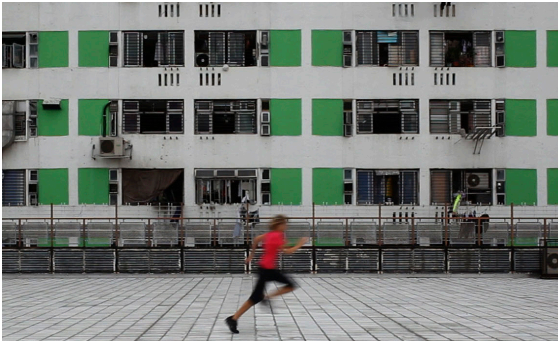
Runscape (2010) Video, 24 min 18 sec

The City is growing Inside of us... A political act of defiance of the Urban Authority With its surveillance and restrictions on movement. - [Excerpt from Film]