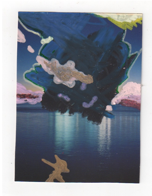
sky can be more blue (2020) , mixed technique on postcard, approximately 10 x 15 cm

The work shown in this exhibition is part of Claudia Chaseling's extensive series she entitles 'Small Paintings'. Sky Can Be More Blue , created during the pandemic lockdown of 2020, is a dream of better days and more open times; a way of traveling without travelling during periods of closed borders. This work is no less powerful for its diminutive scale. The 'Small Paintings' were begun in 1998 when the artist was living in NY, and resumed throughout her diverse periods of living abroad. Painting over postcards she collects throughout her life's journey, Chaseling approaches this aspect of her practice as a kind of diary, inscribing each work with text relating to her experiences.