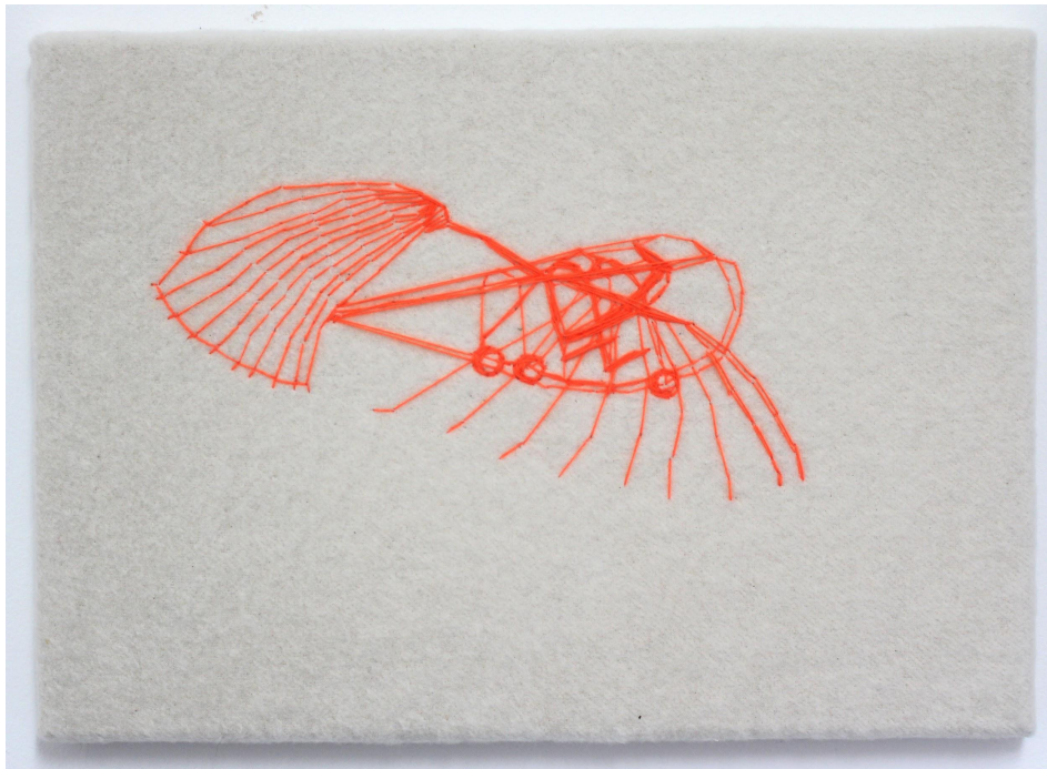
Threads of Surveillance. Soft Drones 7 (2020), Embroidery, thread, interlining fabric, 25 x 35 cm