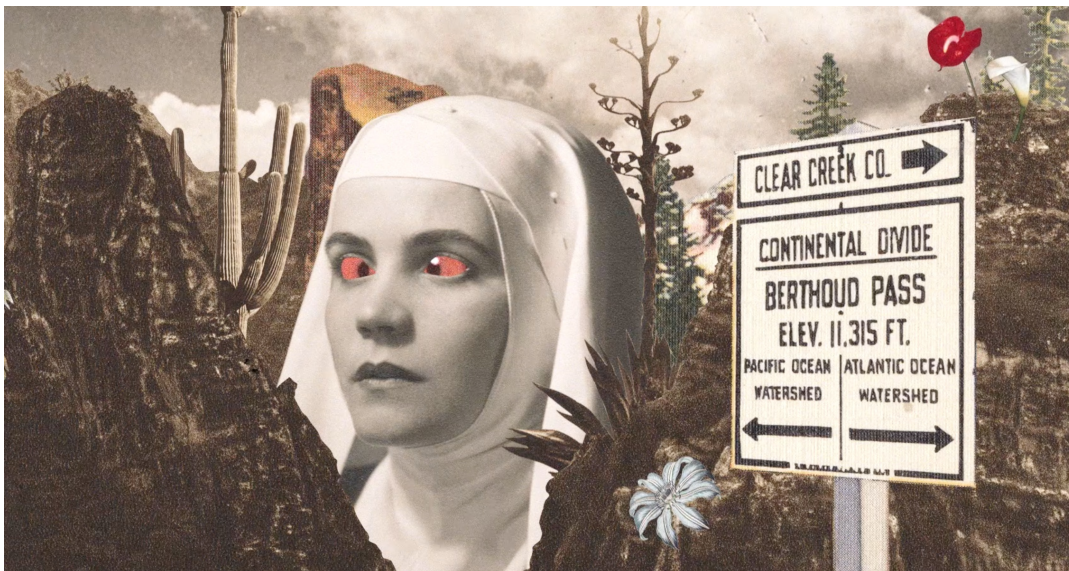
Continental Divide (2010), Video animation, 9 min 44 sec