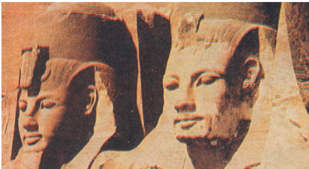
Freude (2009), Video animation, 2 min 5 sec