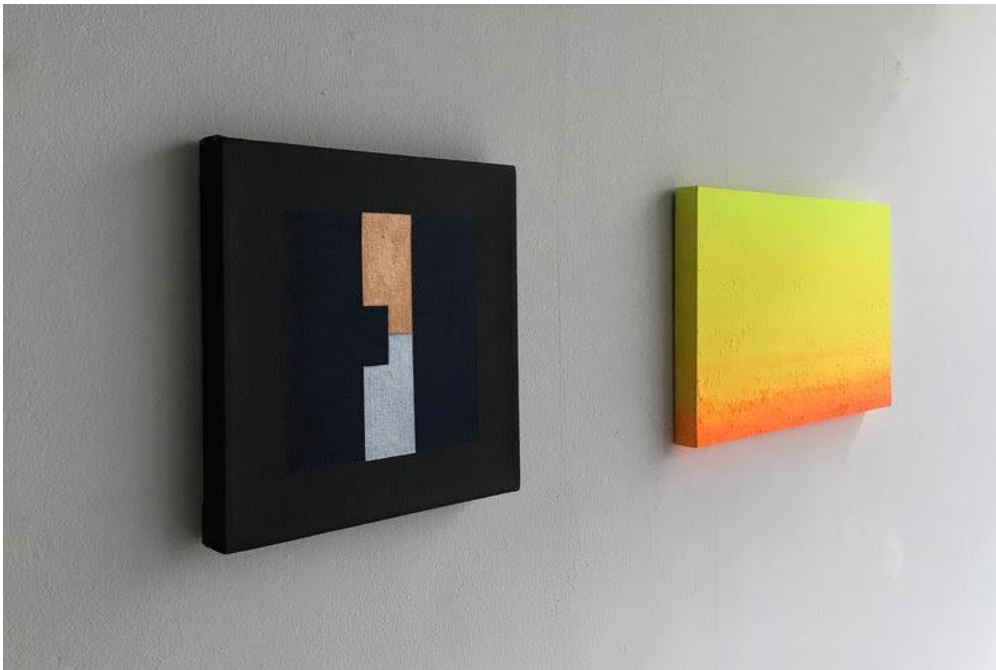
YIN / YANG, 2012/13. Metal pigment and acrylic on canvas. 40 x 30 cm.

“I am particularly proud of the fact that this Church is associated with Dietrich Bonhoeffer. I discovered the letters of Bonhoeffer many years ago in the 1960s when I was actively reading the work of German theologians. Bonhoeffer offered a moving account of his activist position combined with his deeply moving spiritual concerns.”