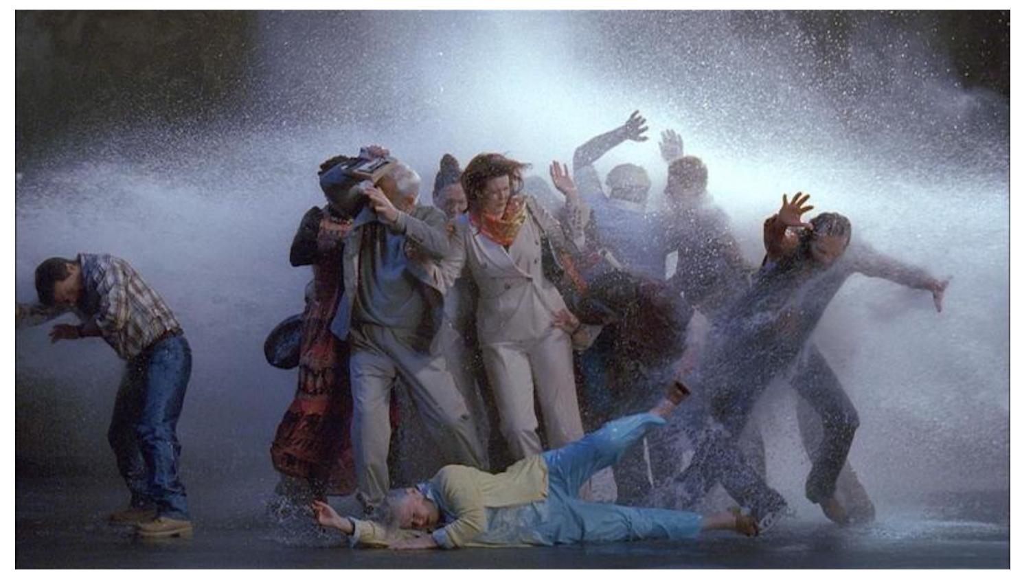
Bill Viola: 'Tempest (Study for the Raft)', 2005, HD video, 16min, 50sec // Courtesy of the artist

Presented in Berlin's Zionskirche, 'Points of Resistance' enters into dialogue with the history of the church as a site of resistance against the Nazis and as a safe haven for opposition groups during the GDR. Through a variety of media, including painting, photography, sculpture, video, sound, performance, and discussion, the exhibition acts as a point of reflection on these past political situations, as well as our present moment. According to curator Constanze Kleiner, "the Zionkirche church in Berlin has a distinguished history as a refuge and work space for people who think differently." It is in that spirit that the exhibition invites its artists to present positions on resistance.